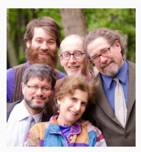
Casco Bay Tummlers Klezmer Band

All families are welcome to join us for this morning of fun together.